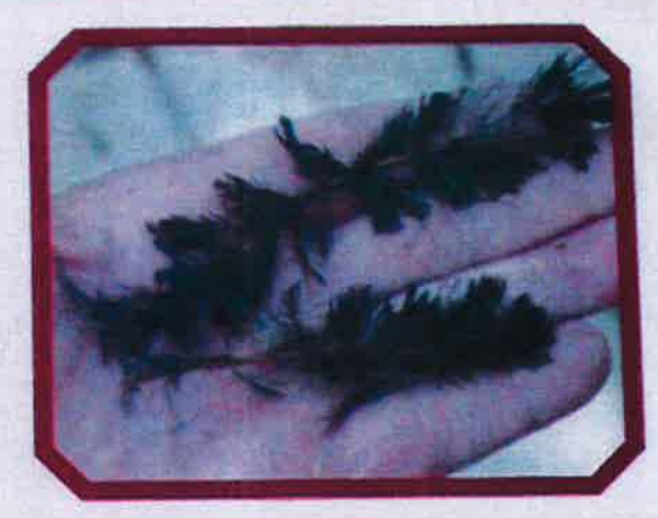
Also present in the Truckee River is Eurasian Watermilfoll