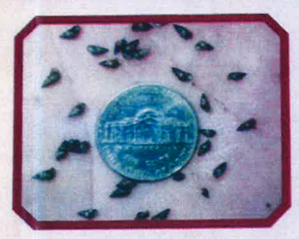
New Zealand Mud Snails are in the Truckee River